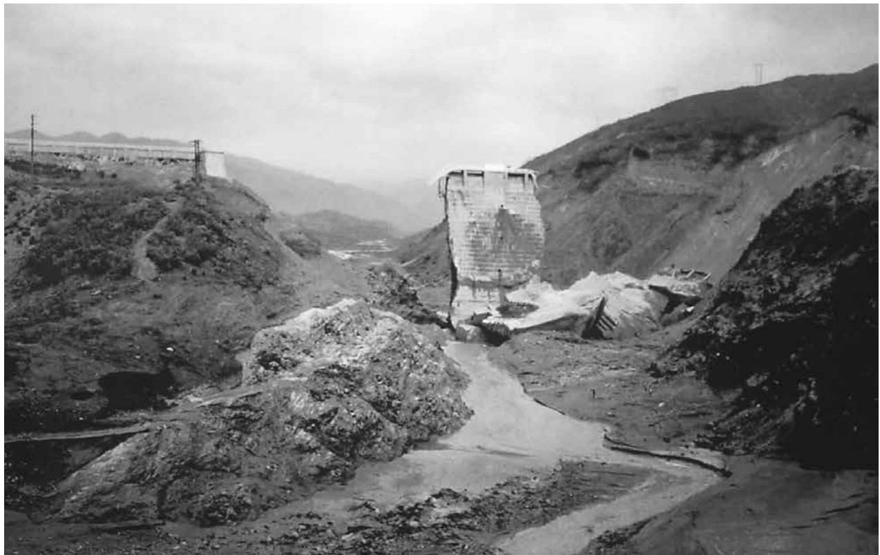
St Francis Dam after the collapse; see pages 1 and 7 for March 11 lecture and tour