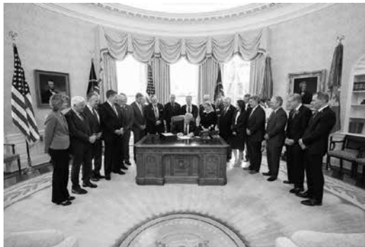
Bill signing: March 12, 2019