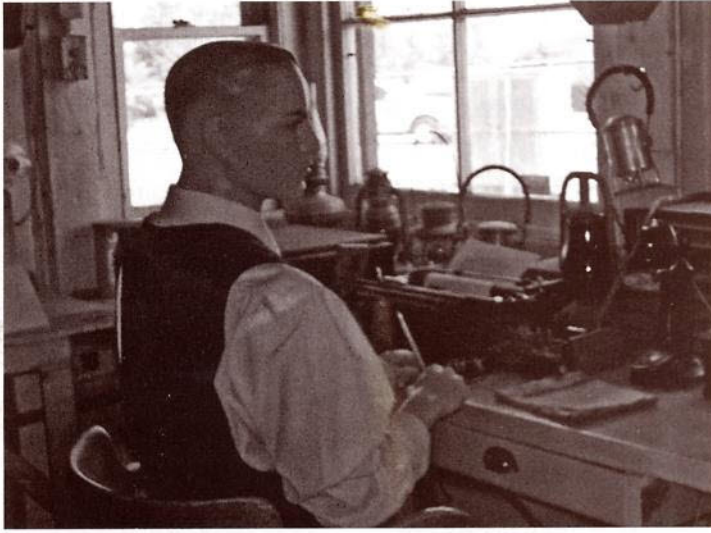
The Station Agent Is Not Very Talkative