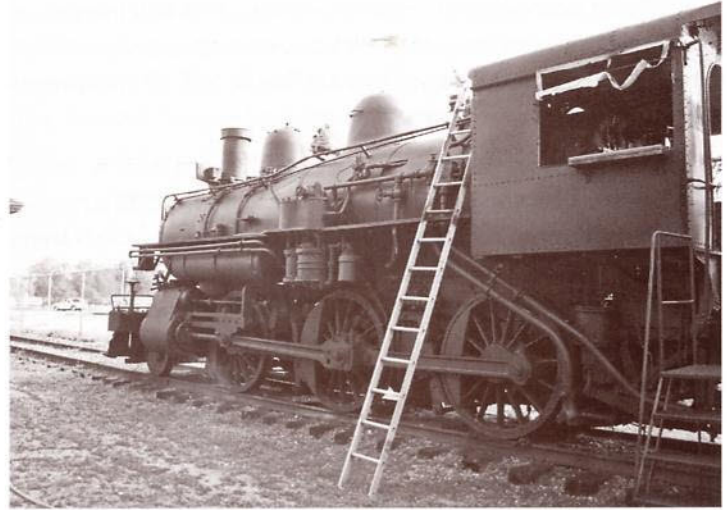
Repainting SP 1629